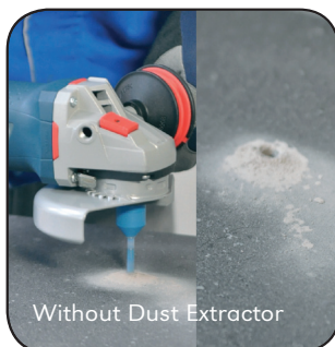
Without Dust Extractor