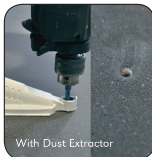
With Dust Extractor