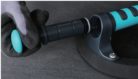
4.1 Clean the plunger if it leaks